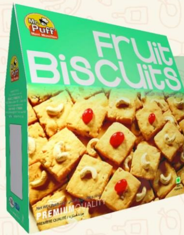
Fruit Biscuits 200g/400g