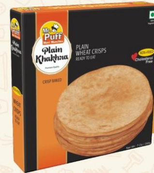
Plain Khakhra 200g