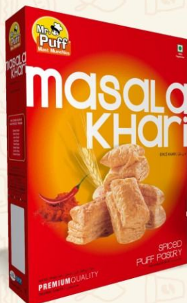
Masala Khari 200g/400g