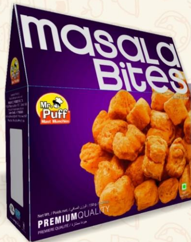
Masala Bites 150g