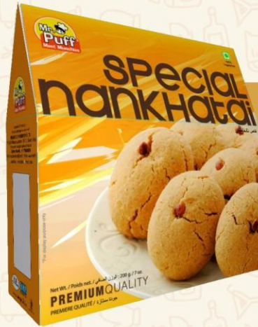
Special Nankhatai 200g