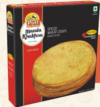
Masala Khakhra 200g