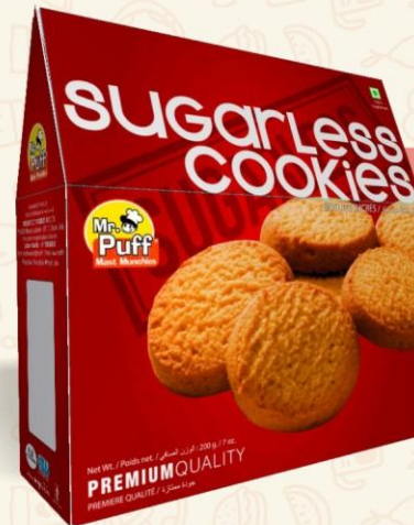
Sugarless Cookies 200g