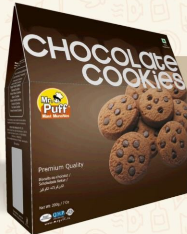
Chocolate Cookies 200g