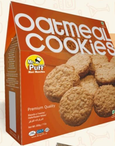
Oatmeal Cookies 200g