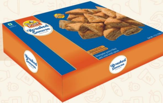
Roasted Samosa 200g