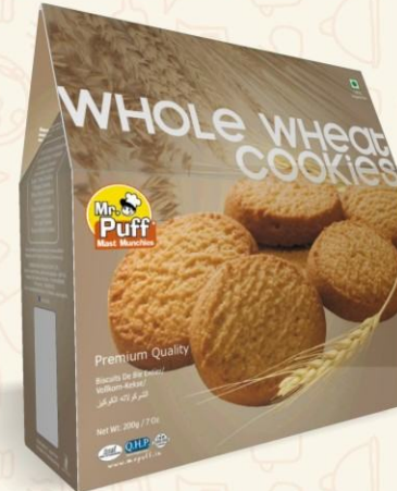
Whole Wheat Cookies 200g