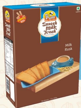
Sweet Milk Rusk 200g