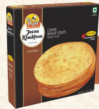
Jeera Khakhra 200g