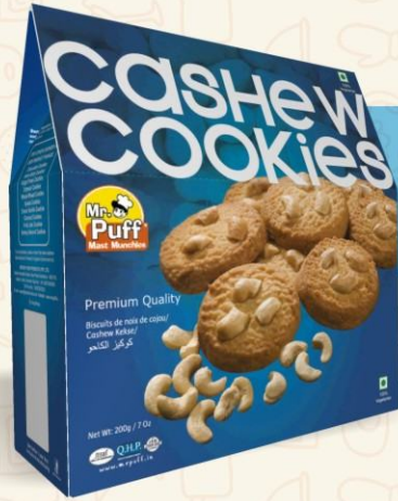
Cashew Cookies 200g