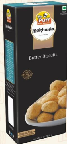
Surti Biscuits (Makhania) 200g