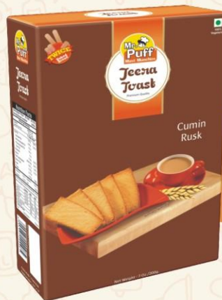
Jeera Rusk 200g