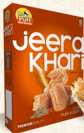
Jeera Khari 200g/400g