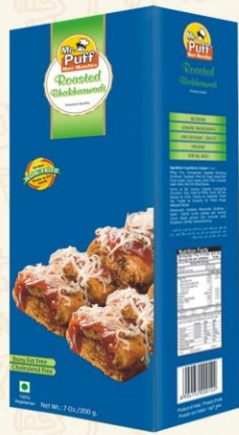
Roasted Bhakharwadi 200g