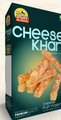
Cheese Khari 150g