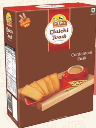
Elaichi Rusk 200g