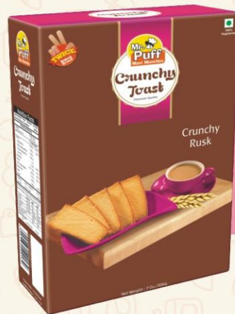
Crunchy Rusk 200g