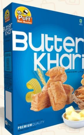
Butter Khari 200g/400g