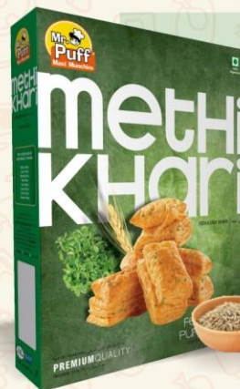
Methi Khari 200g