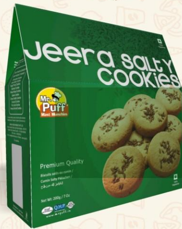
Jeera Salty Cookies 200g