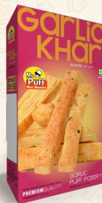
Garlic Khari 150g