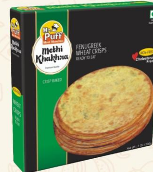
Methi Khakhra 200g