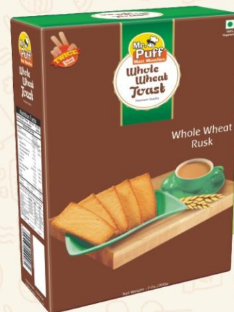
Whole Wheat Rusk 200g